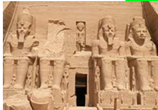
Four huge statues of Ramses II sit in pairs by the entrance.

The Temple itself was built by Ramses to demonstrate his power and good nature.